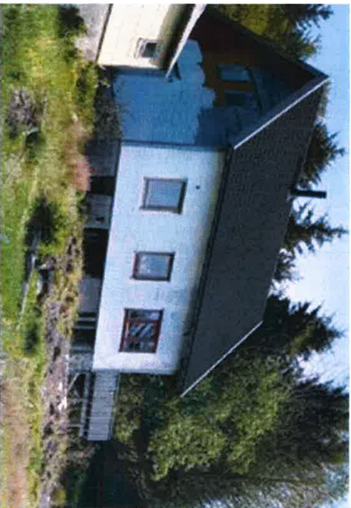
Situasjon i dag