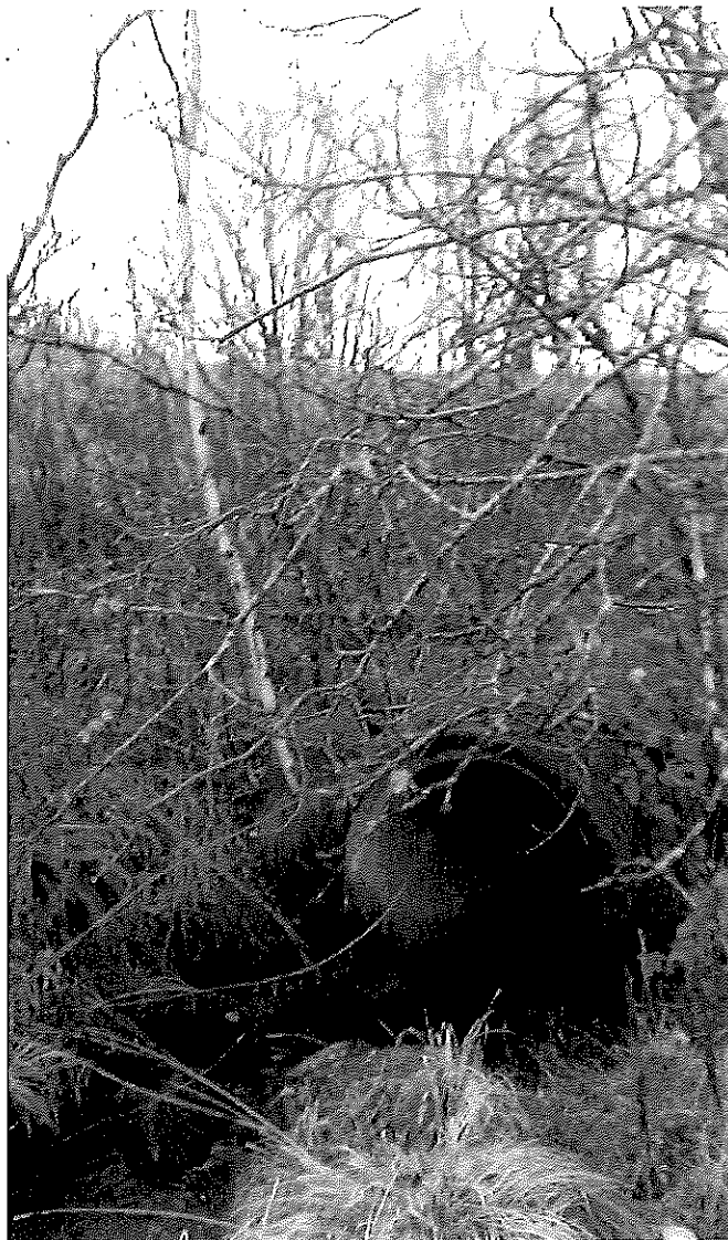
Figure 4-1: Stream from south passing the road in culvert (Reference). Road can be seen above.