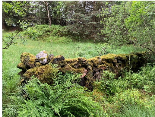
East side of stone wall delineating innmark vs. utmark