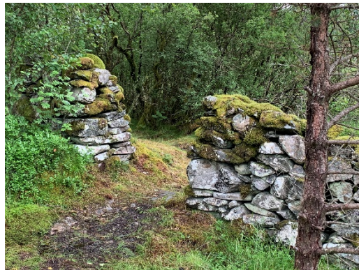
West side of stone wall delineating innmark vs. utmark