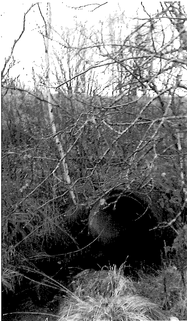
Figure 4-1: Stream from south passing the road in culvert (Reference). Road can be seen above.