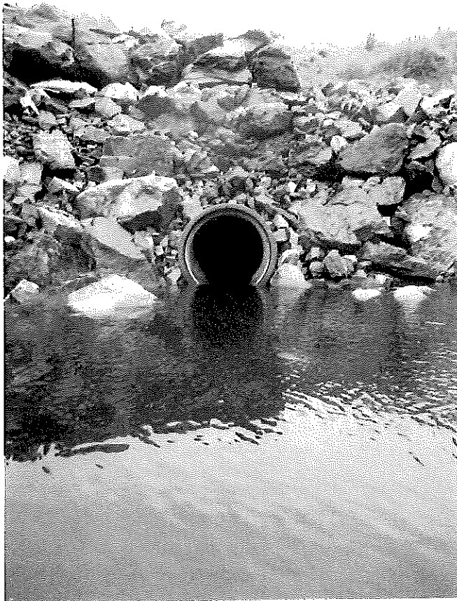
Figure 4-3: Stream going through culvert by the quarry. Sampling at this site was done only 12. September.