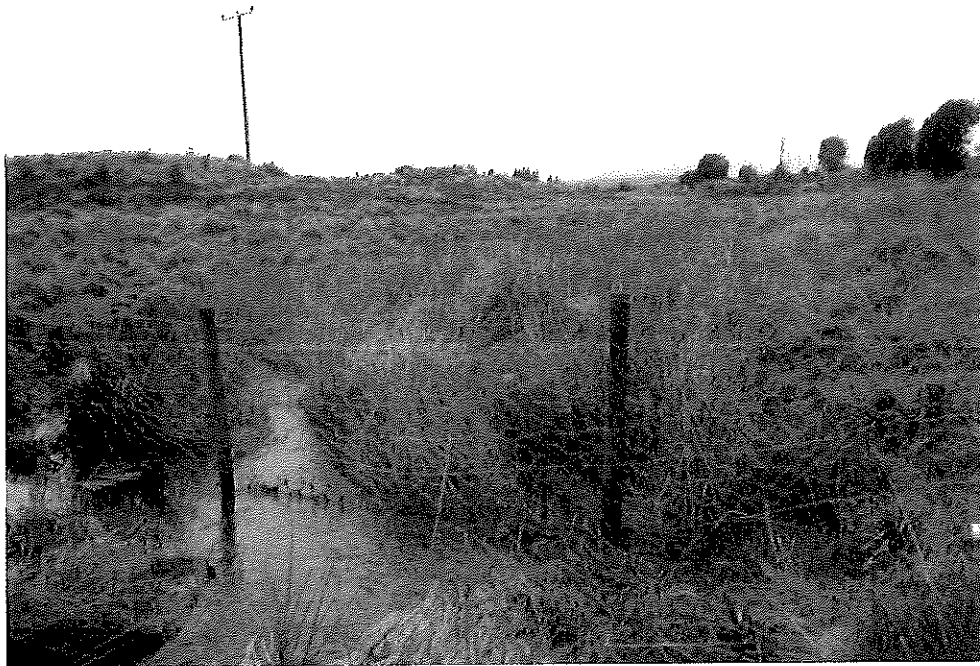
Figure 4-4: Stream from the restoration site going north towards the sea. Sampling of runoff was done at the fence.