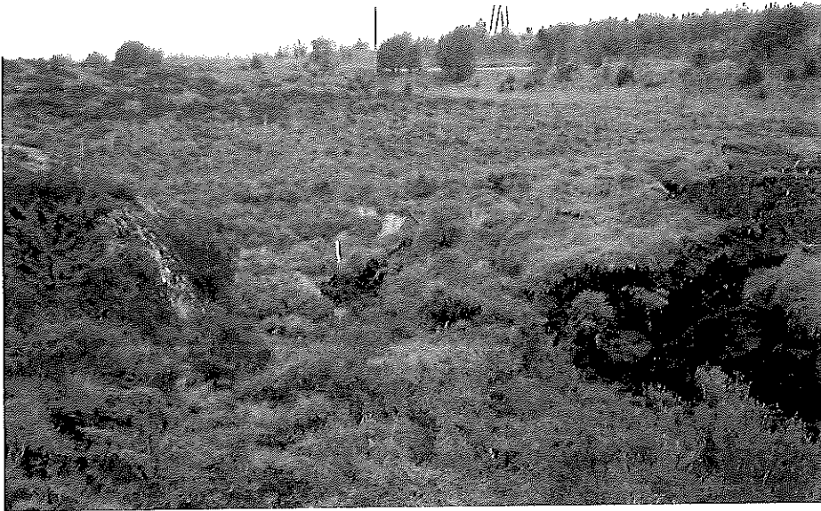
Figure 4-2: Well (white stick) and trickle west of the front of the restoration site (front of restoration area to the right).