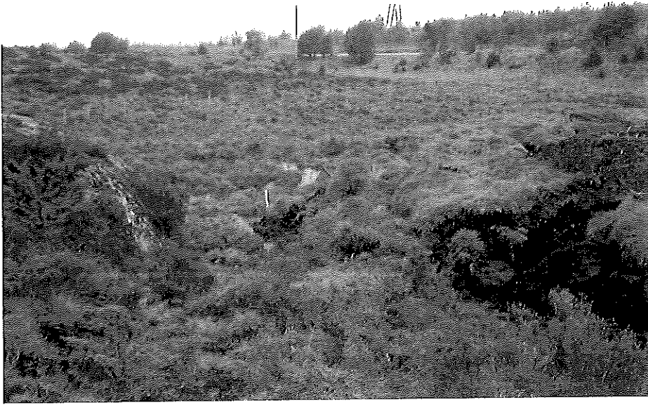
Figure 4-2: Well (white stick) and trickle west of the front of the restoration site (front of restoration area to the right).