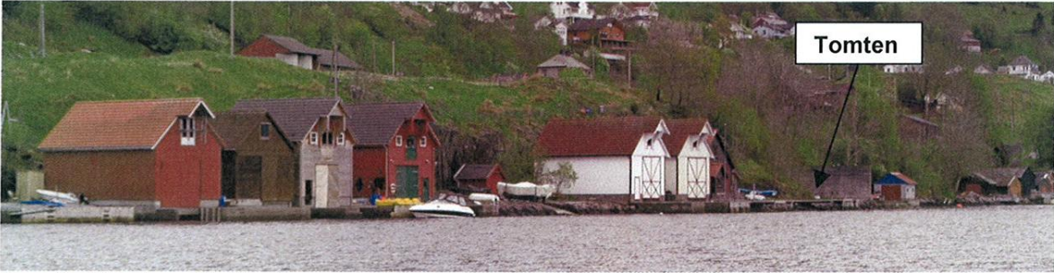
Naustrekker lang Rydlandsneset, Seim.