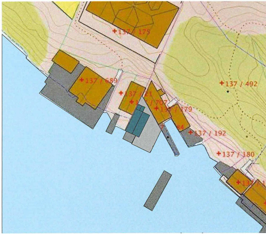
Plan 1 til 200 1:200