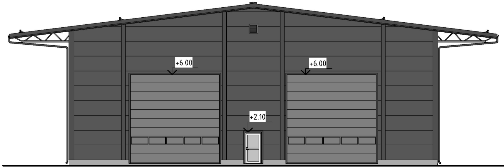
FASADE I LINJE 13 NORD