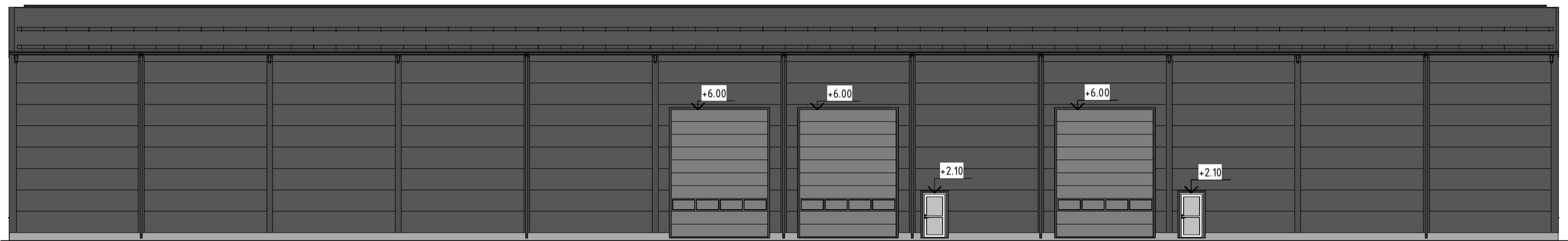
FASADE I LINJE H SØR