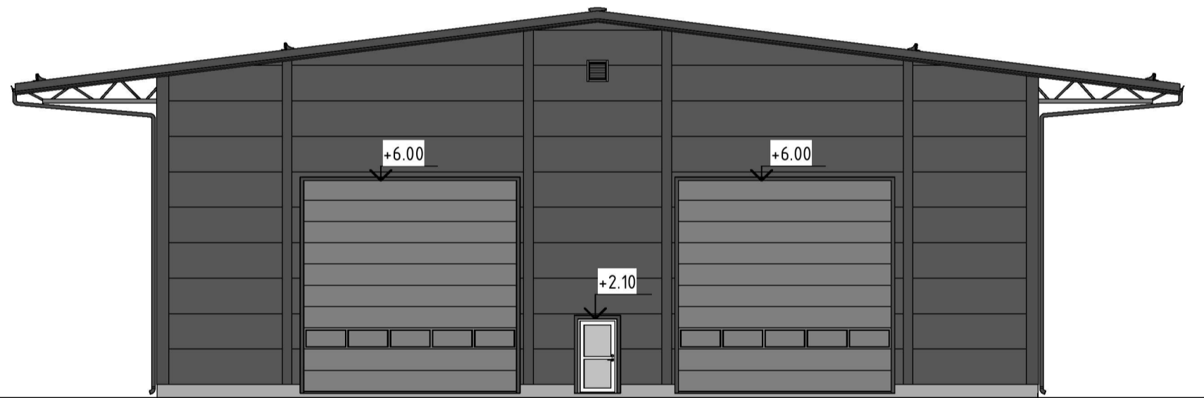
FASADE I LINJE 1 VEST