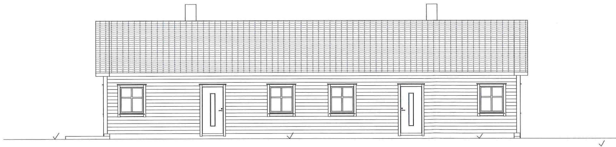
3 Nord/øst 1 : 100