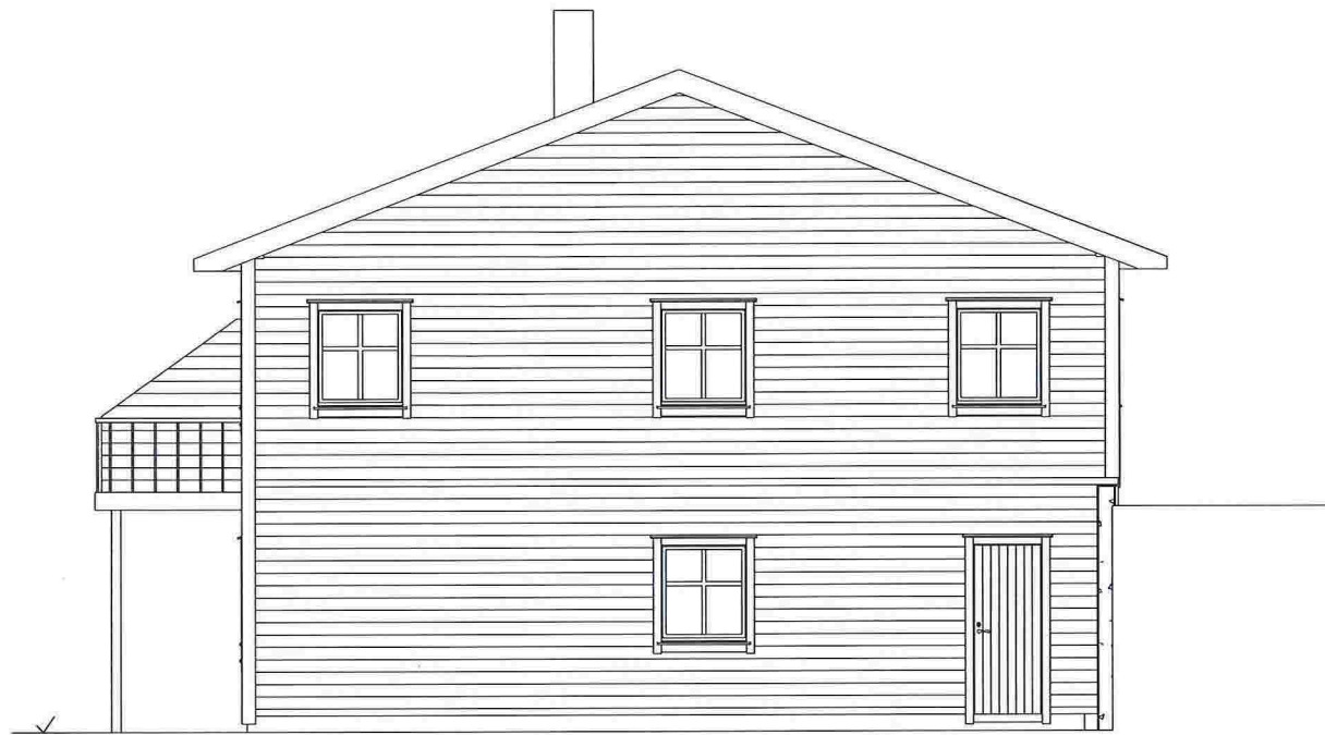
1 Sør/øst 1 : 100