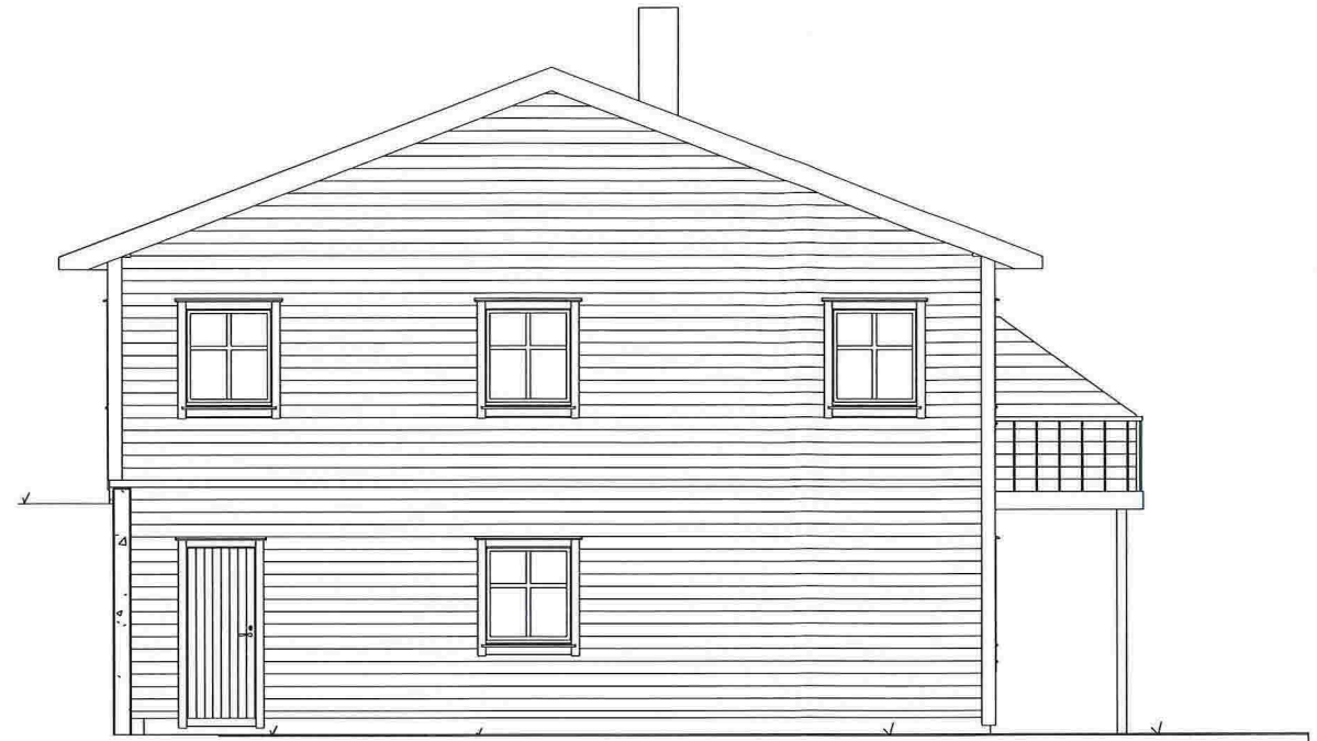
2 Nord/vest 1 : 100