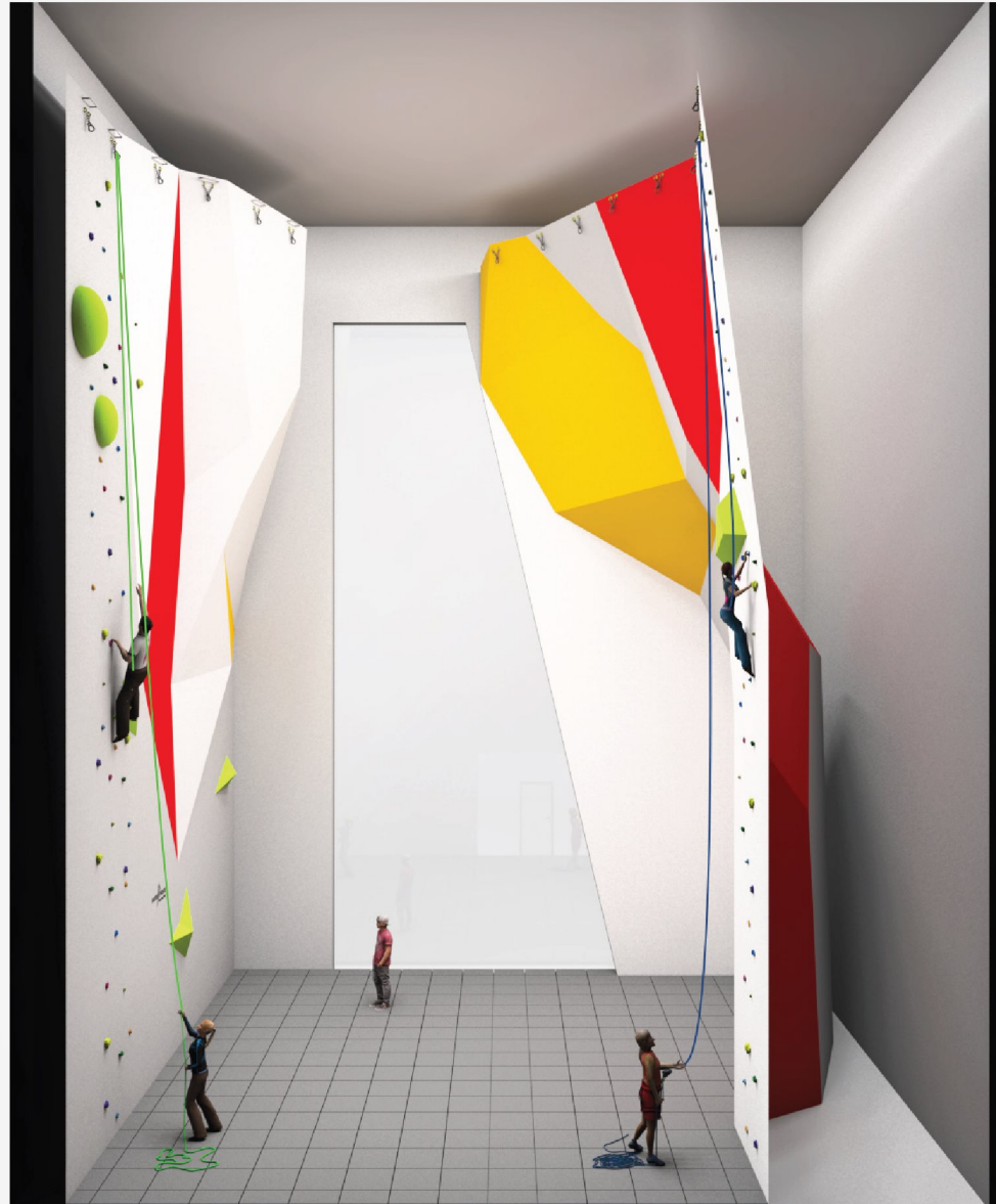
GENERAL SECTION ON BOTH 14M LEAD WALLS