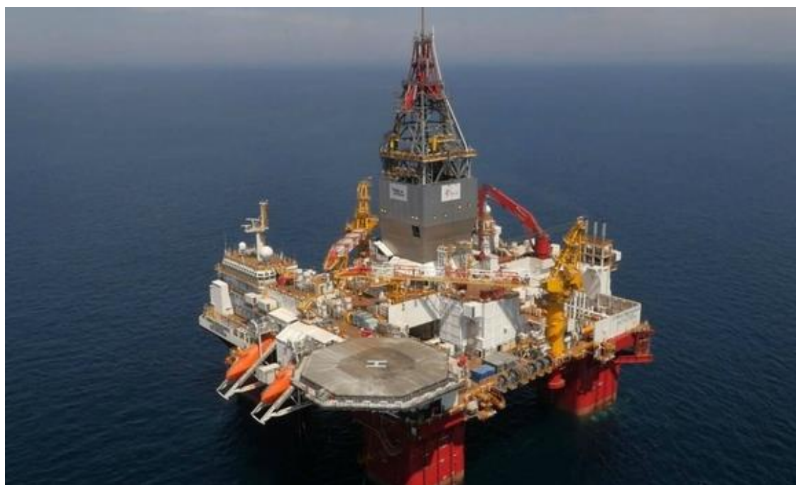
Figure 1 Songa Endurance

Note that the rigs location, chain length and anchor positions given in this document are preliminary and may be subject to minor changes.